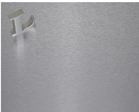
ClearBrite® Short Line Brush