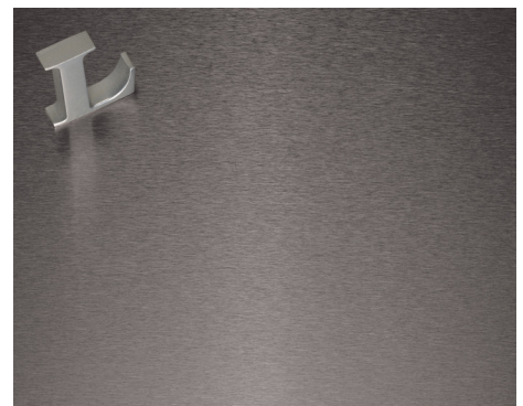
AlumaPlus® Short Line Brush