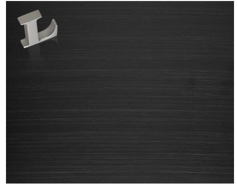
Black Stainless Long Line Brush