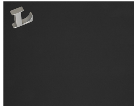
Black Stainless Mill Finish